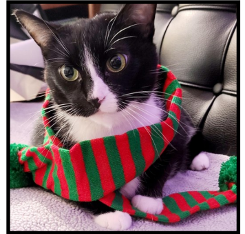
Holiday Greetings from the VCRC Board of Directors

One of our proud initiatives is our "Oops" Program, which offers free spays to individuals who surrender their kittens to us. This summer alone, this program has prevented countless litters and ensured that surrendered kittens are cared for, loved and adopted into wonderful homes. Together we're addressing overpopulation and giving cats the futures they deserve. Continued on page 4.