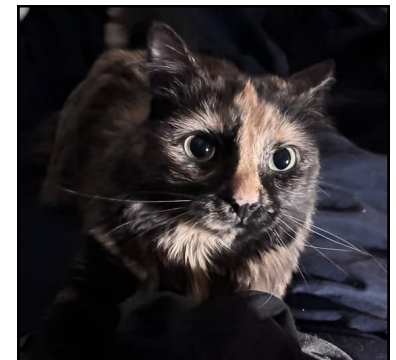
Beautiful Freya needs a calm, quiet forever home.