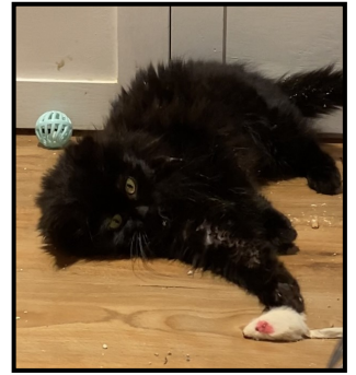
Amber safe and playing with toys

Amber is our latest addition: On January 28th we were called to a very busy and dangerous industrial site and asked to assist in rescuing a mother cat and her two kittens. No one knows how this family ended up there, but thankfully the business called us for help. We have managed to trap Amber and her mother so far. This one little bean has wasted no time in filling her belly with good food and playing with toys. Soon she will understand that only good things will happen moving forward. Photos of the rescue site are available on our Facebook page.