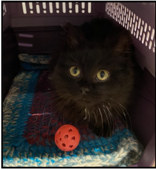
Amber when first trapped

Amber is our latest addition: On January 28th we were called to a very busy and dangerous industrial site and asked to assist in rescuing a mother cat and her two kittens. No one knows how this family ended up there, but thankfully the business called us for help. We have managed to trap Amber and her mother so far. This one little bean has wasted no time in filling her belly with good food and playing with toys. Soon she will understand that only good things will happen moving forward. Photos of the rescue site are available on our Facebook page.