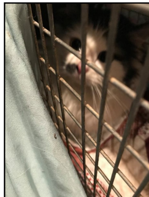
Safe at Last