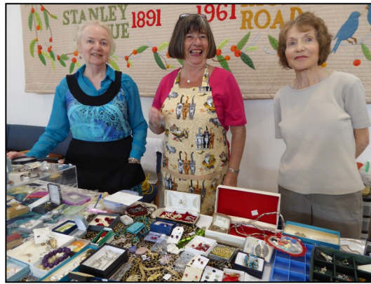
Volunteers at the Jewelry Table