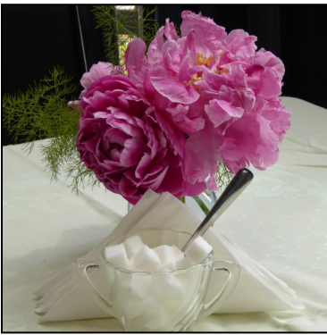
Beautiful table settings