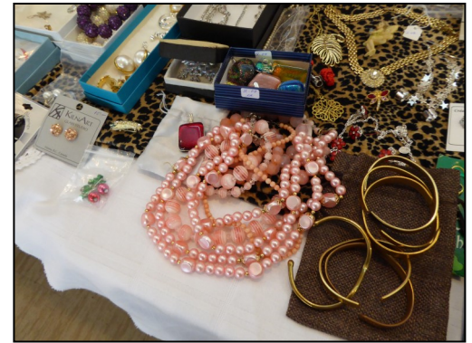
There are Treasures to be found