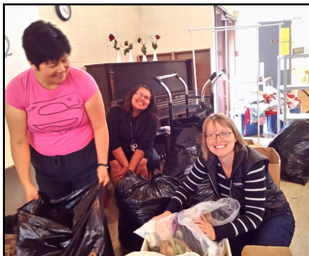
OUR VOLUNTEERS PACKING UP AFTER THE STRAWBERRY TEA