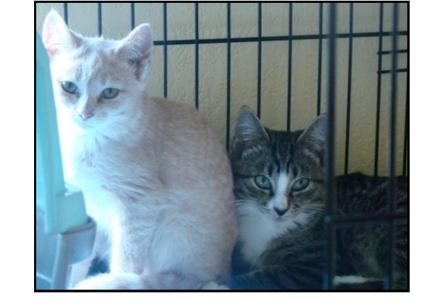
Mook & Naira-waiting for a new home.

Why not volunteer today? Just call 250 656-1100.