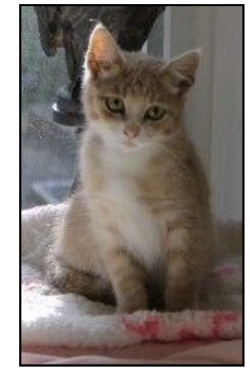
Adorable Sophie Special Needs Kitten that needs a home. See her story at victoriacatrescue.com

Please cut out the mini poster on page 4 and post it in your neighbourhood. Make extra copies if you can. Spread the word! Call (250) 656-1100 for more information.