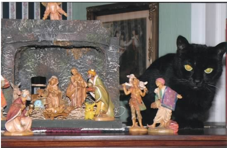
The cat in the manger. Gigi helps with the Christmas decorating.

Our Treasurer tells us that our 2012 event was the best Strawberry Tea ever! Thanks to all who volunteered and also to our loyal customers. A detailed list of donors and a grateful thank you was printed in the Spring newsletter .