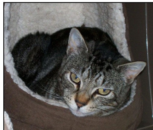
Jake- patiently waiting for adoption.