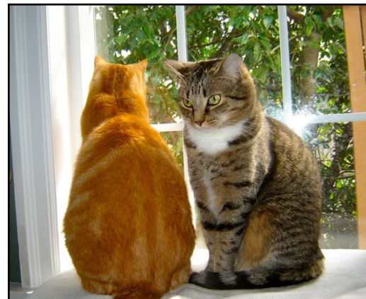
LEO AND BENNY IN THE WINDOW SEAT